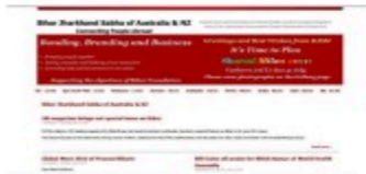
Bihar Jharkhand Sabha