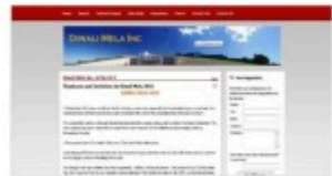
Diwali Mela Inc