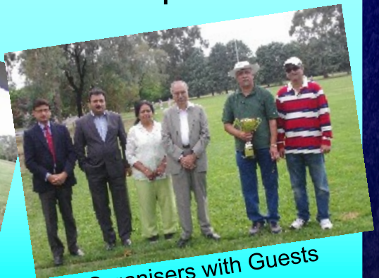
Organisers with Guests