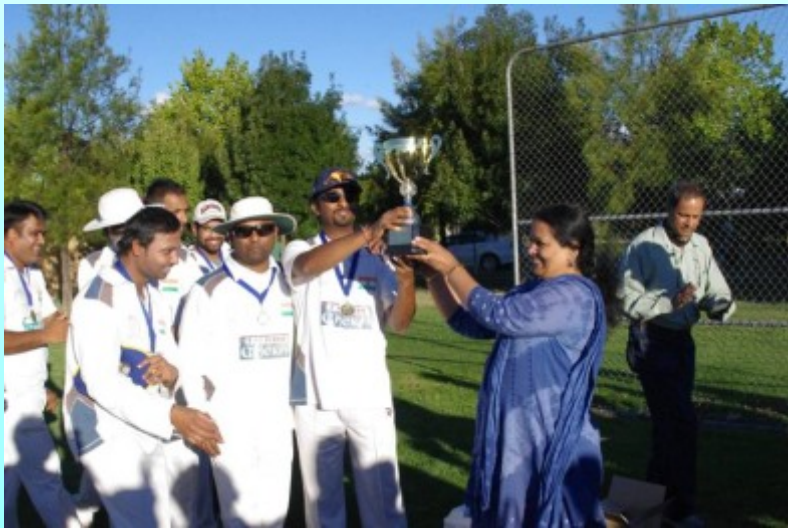
Turbo Tamils Lifted the Cup