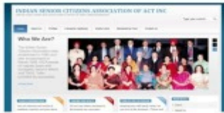
Indian Senior Citizens Association