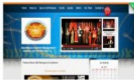
Shine n Rise Events