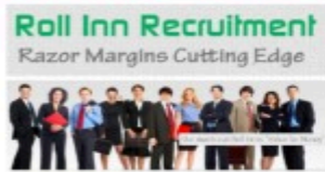
Roll Inn Pty Ltd

We offer services and assistance to help you publish your own websites - personal blogs, community website, information site or a simple commercial website for your business needs.